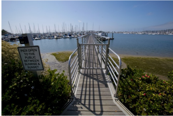
THE LACY PIER