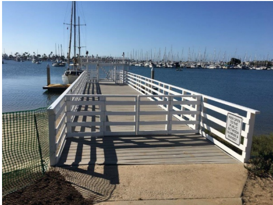
THE DONNELLY PIER