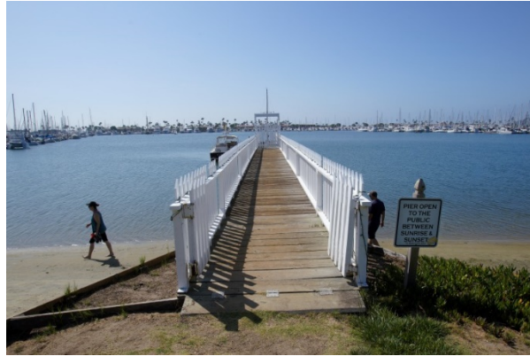
THE WYATT PIER