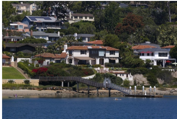
THE ARLINGTON/DALY PIER