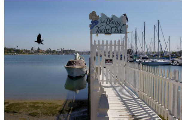
THE LA PLAYA YACHT CLUB PIER